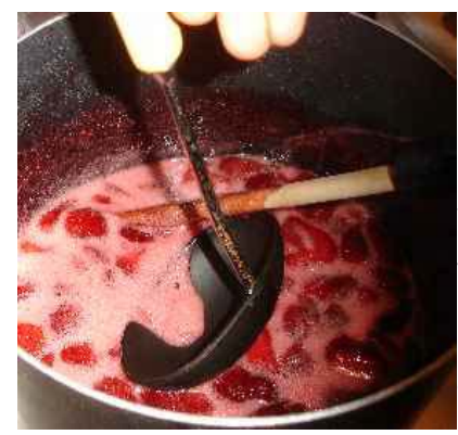
Step 11 - Skim any excessive foam

Foam... What is it? Just jelly with a lot of air from the boiling. img border="0" src="cherry/foam.jpg" width="142" height="139" align="right"> But it tastes more like, well, foam, that jelly, so most people remove it. It is harmless, though. Some people add 1 teaspoon of butter or margarine to the mix in step 6 to reduce foaming, but food experts debate whether that may contribute to earlier spoilage, so I usually omit it and skim.