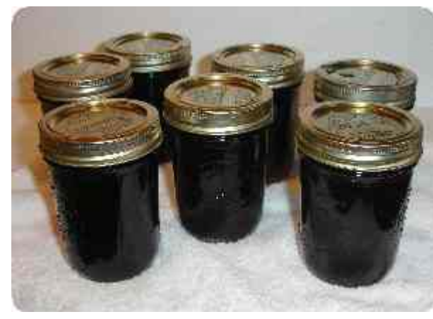
Step 16 - Remove and cool the jars - Done!

Lift the jars out of the water with your jar lifter tongs and let them cool without touching or bumping them in a draft-free place (usually takes overnight) You can then remove the rings if you like. Once the jars are cool, you can check that they are sealed verifying that the lid has been sucked down. Just press in the center, gently, with your finger. If it pops up and down (often making a popping sound), it is