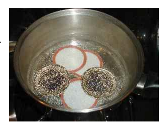
Page 9 of 13

Lids: put the lids into a pan of hot water for at least several minutes; to soften up the gummed surface and clean the lids.