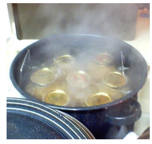
Page 5 of 8

Drain the mixed fruit (I just put it in a colander). Next add 1/2 cup of the hot syrup from step 2 to each jar Then gently fill the jar with mixed fruit and more hot syrup, until you reach 1/2-inch from the rim (which is called leaving 1/2 inch of headspace)