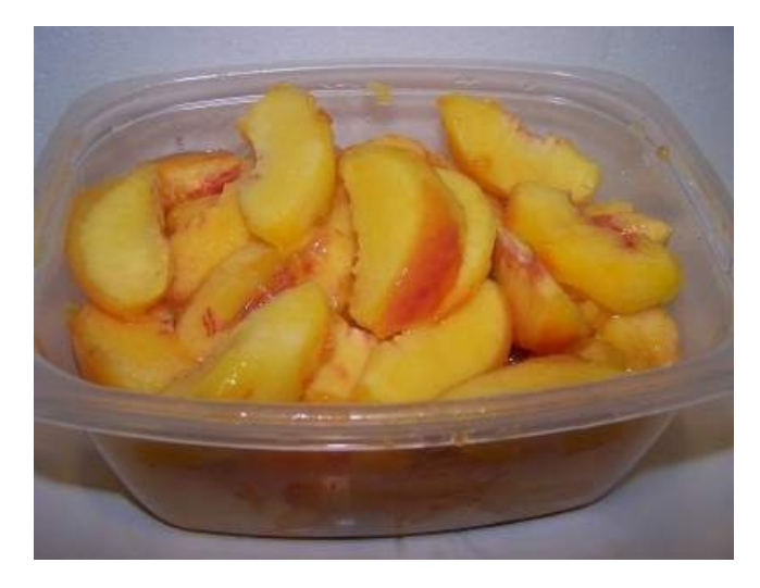
Step 7 - Prevent the fruit from darkening!

Cut out any brown spots and mushy areas. Cut the peaches, pears, plums, apricots, etc. in half, or quarters or slices, as you prefer! Remove pits, stems and any other inedible bits.