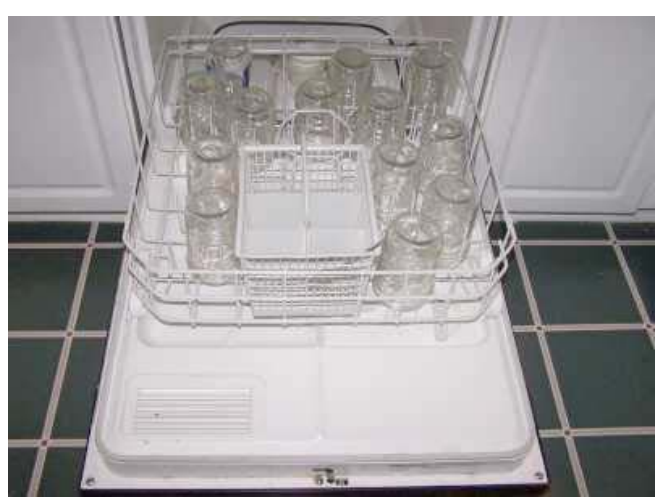
Step 4 - Wash the jars and lids

This is a good time to get the jars ready! The dishwasher is fine for the jars; especially if it has a "sterilize" cycle. Otherwise put the jars in boiling water for 10 minutes. I just put the lids in a small pot of almost boiling water for 5 minutes, and use the magnetic "lid lifter wand" (available from target, other big box stores, and often grocery stores; and available online - see this page) to pull them out.